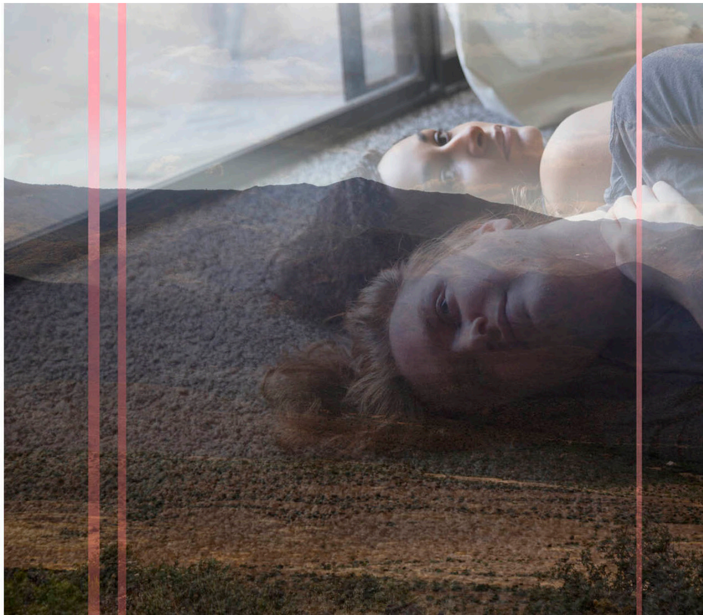
The Space Between Us